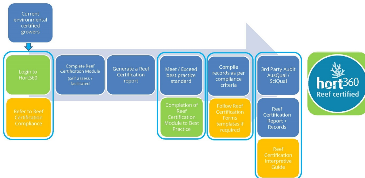
Figure 1: Hort360 Reef Certification Flow Chart