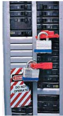
Danger tagged circuit breaker locking off devices