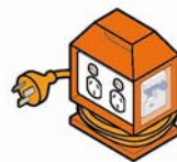
Figure 4 Portable safety switch protected power board