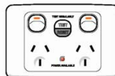
Figure 2 Fixed socket outlet safety switch

Portable safety switches (see Figure 3 and Figure 4) are generally plugged into a socket outlet and, depending on design, may protect one or more items of electrical equipment.