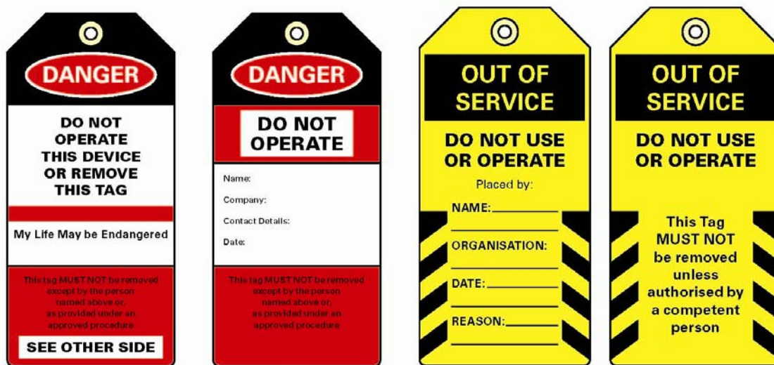
Figure 6: Example of a danger tag and out of service tag