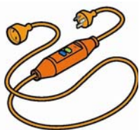
Figure 3 Portable safety switch fitted directly to power cable